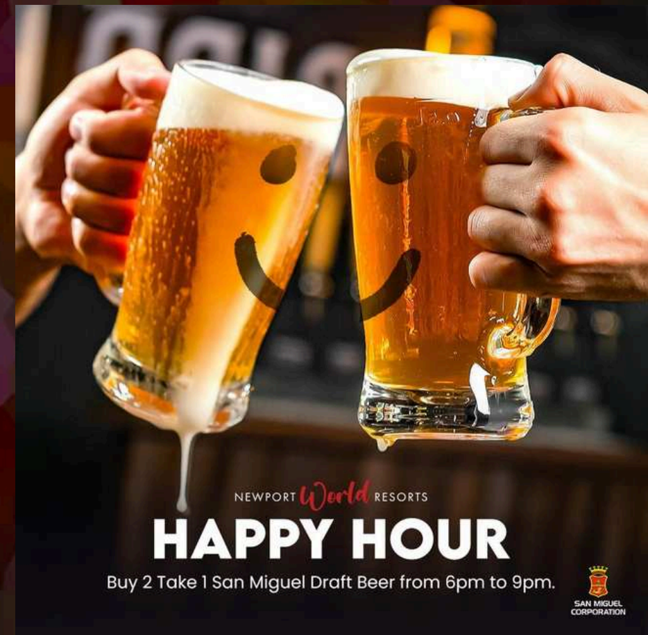
Happy Hour with San Miguel Draft Beer